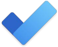
Microsoft To Do